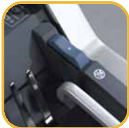
Electric punching for ultimate ease of use