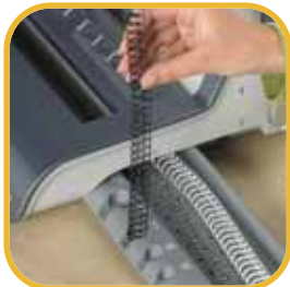
Patented wire & document measure allows user to select quickly