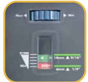
Preselectable closure control for easy wire closure - ideal for binding multiple documents