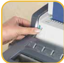
Adjustable edge guide aligns sheets accurately