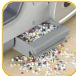
Chip tray with burst out feature to eliminate jams