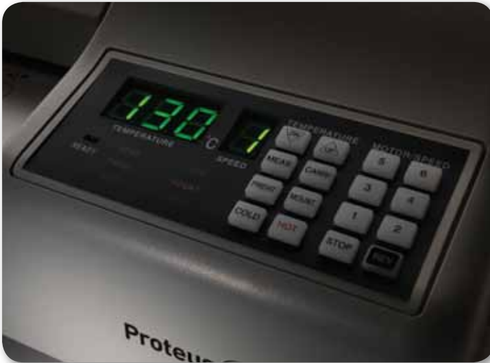
Advanced control panel for flexibility and ease of use