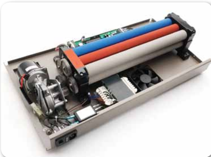
6-roller engine with large diameter rollers (4 hot rollers & 2 cold)

Unique low friction laminating offers jam free performance with Fellowes branded pouches